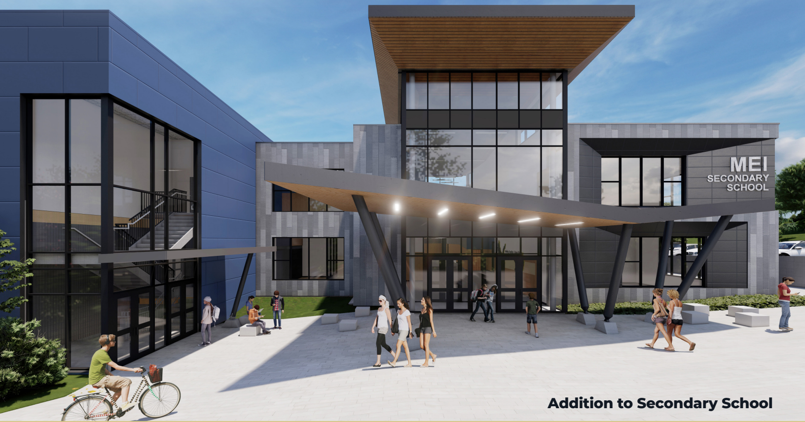
Addition to Secondary School

Let us praise God for the $13.5 MILLION THAT HAS BEEN RAISED in support of our Campus Improvement Project. $7M was raised during a 6-month “Quiet Phase” in 2021/2022 and another $6M was raised during a 3-month “Public Phase” in 2022/2023. Since then, an additional $500K has come in from a variety of donors. Again, praise the Lord!