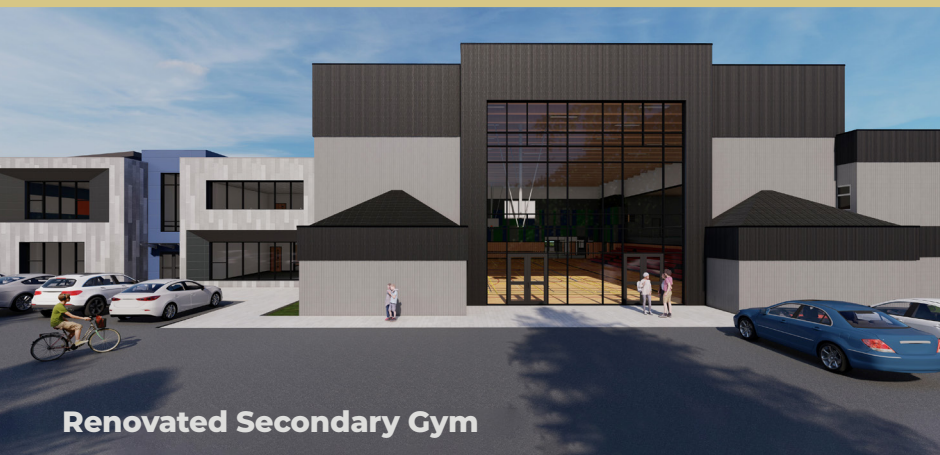
Renovated Secondary Gym